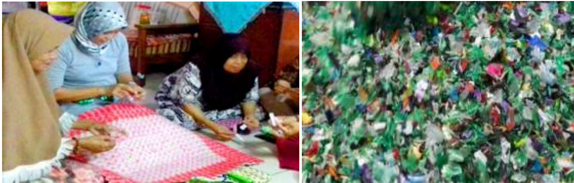
Fig. 4 Assistance result plastic waste craft in, the village of Kejagan, Trowulan, Mojokerto