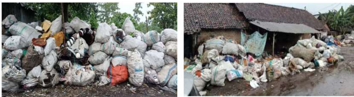
Fig 2. The garbage that the cauldrons have collected in the village of Kejagan, Trowulan, Mojokerto

Rural communities Kejagan, Trowulan, Mojokerto majority is just a garbage caulk so that the creativity and products of the garbage bank are not yet available sustainable village development capacity for economic sustainability citizen. As the picture below shows that Banks are garbage untouched and sorted for valuables.