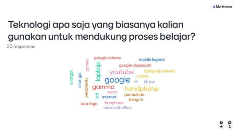
Figure 2. The Mentimeter result on technology types used to support teaching and learning

For the second survey on the types of technology they liked to use to support learning, most of the participants mentioned Google, mobile phones, laptops, YouTube, and Gamma. The remaining technology they mentioned included TikTok, Canva, Zoom, Internet, Microsoft Office, games, Google Scholar, Mobile Legend, ChatGpt, Duolingo, Telegram, lcd, and Persplexity. The response is presented in Figure 2.