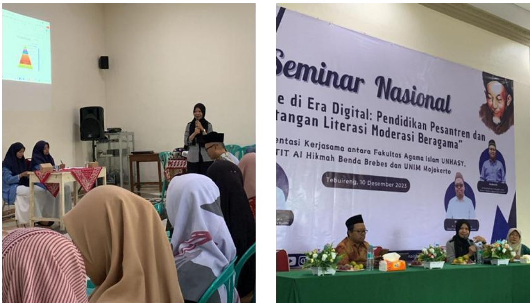
Figure 1. The presentation session (Left). The question-and-answer session (Right)

The seminar participants consisted of students and lecturers in Islamic Education faculty, Universitas Hasyim Asy'ari, Jombang, Indonesia. The theme of the seminar was "Resilience in the Digital Era: Education in Islamic Boarding Schools and Its Challenge in Religious Moderation Literacy".