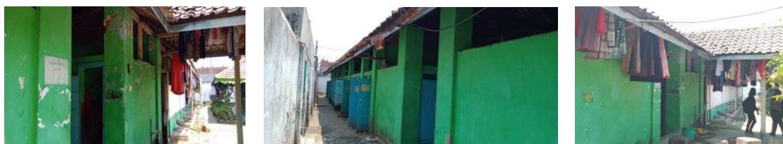
Figure 1. Existing conditions of bathrooms and toilets at the Mambaul Ulum Islamic Boarding School

From the beginning of the construction of the Islamic boarding school until now, the buildings used by the students for their daily activities have not changed. So that the condition of the building is still an ancient building and less suitable according to construction standards. The buildings that are prioritized for renovation are the bathroom and toilet buildings. This is because some toilets are not functioning properly, the size of the toilets is too small, making it difficult for the students to move around and the layout of the toilets and bathrooms is not in accordance with construction rules. On the other hand, a bathroom renovation needs to be done to make washing and drying facilities. Currently washing activities are carried out by students in the washing area, while the facilities for drying are almost non-existent, so the students are drying clothes in front of the room each. This certainly disturbs the aesthetics of the boarding school. The problem is that the current building is not designed for a two-story construction, so it is necessary to redesign the building as shown in figure 1.