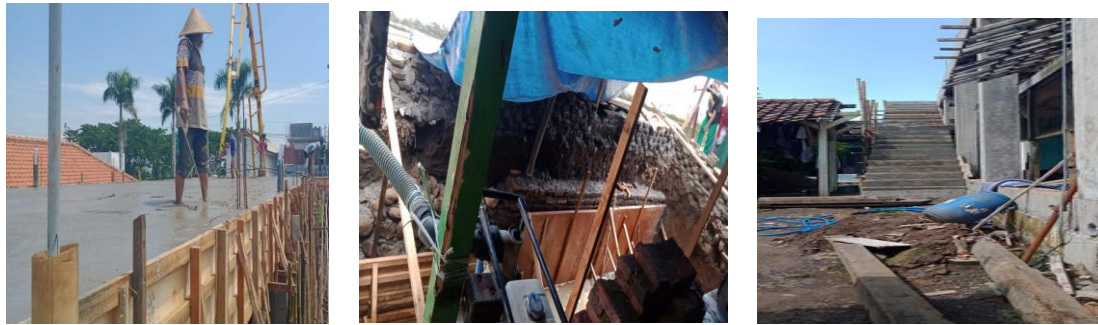
Figure 2. Stage of Construction